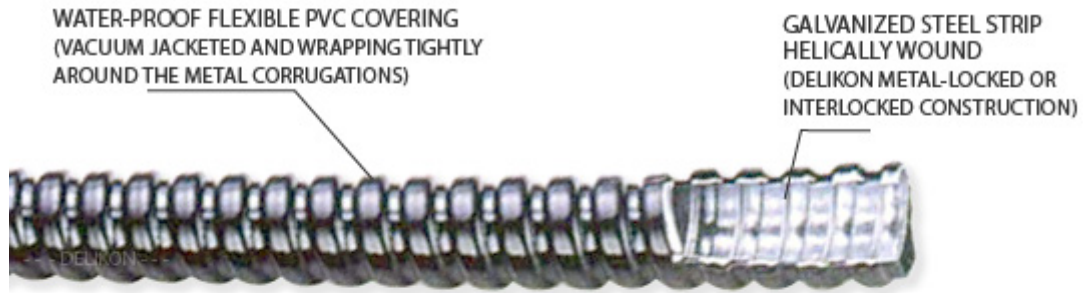
Delikon Metal Forming Technology